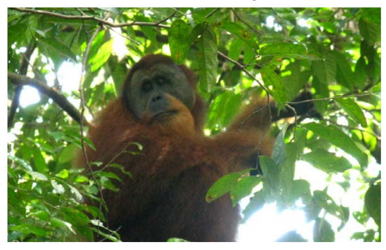
Above: An evacuation of endangered orang-utans from the burning forests of Borneo and Sumatra is being considered by the Indonesian government.

In some areas the smoke has been so dense that people haven't seen the sun for more than two and a half months, while visibility is down to between 50 and 200 metres. Around 500,000 people in the smoke-affected areas have already suffered from respiratory illnesses as a result of the smoke and some 40 million people have been exposed to the toxic smoke haze, especially in Borneo and Sumatra. A mass evacuation of endangered orangutans from affected forest areas is also being considered.