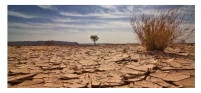
Above: Droughts can be caused by El Niño, which affects rainfall in many parts of the world.

Many parts of southern Africa are already experiencing drier than normal conditions and El Niño is only likely to make this worse from December through until the end of February 2016. Countries likely to be affected by reduced rainfall include Zimbabwe, Botswana, Namibia, Angola, South Africa, Lesotho, Swaziland and southern Mozambique.