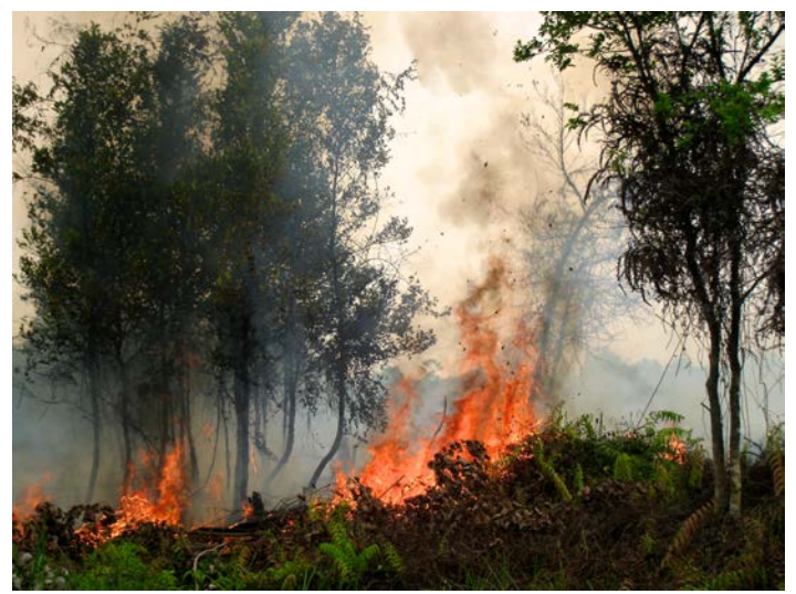
Above: Fires are blazing in Indonesia's rainforests.

Many of the fires are set by slash and burn farmers, while others are thought to have been started by large companies producing palm oil on an industrial scale. Some companies are already being prosecuted for deliberately starting fires.