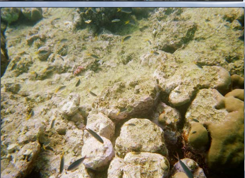
El Nino gallery - clockwise from top left:

Lake Oroville in northern California is at just 29% capacity because of the drought. El Nino might change this for the better. Haze from Indonesia's forest fires hangs over Marina Bay, Singapore. Global coral bleaching is causing coral reefs around the world to die, leaving them white and lifeless. Red crabs on a California beach.