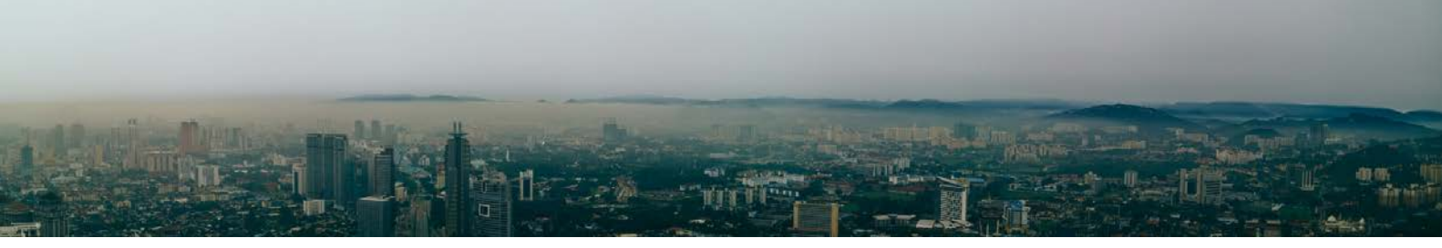
Above: A smoky haze caused by the fires burning in Indonesia hangs over the city of Kuala Lumpur, Malaysia.

The Indonesian government has sent eleven warships and two passenger ships to the worst affected areas to act as shelters and to transport children to safer locations. Meanwhile, some 22,000 soldiers and 30 aircraft are engaged in fighting the fires.