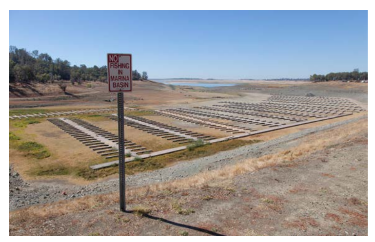
Above: This 'No Fishing' sign at the dried up Folsom Lake Marina shows how desperately California needs the rainfall El Niño may bring.

El Niño will hopefully bring some rainfall to the parched state of California, which has been enduring drought conditions for the last four years. Three storms arrived in a week in December 2015, bringing much needed rainwater. However, the NOAA says that the state will need to see double its usual annual rainfall to get out of drought conditions. The warmer waters of the Pacific caused by El Niño have already carried pelagic red crabs up to the California coast from Mexico, turning beaches red! The warmer waters have also resulted in increasing numbers of sharks being spotted off the California coast.