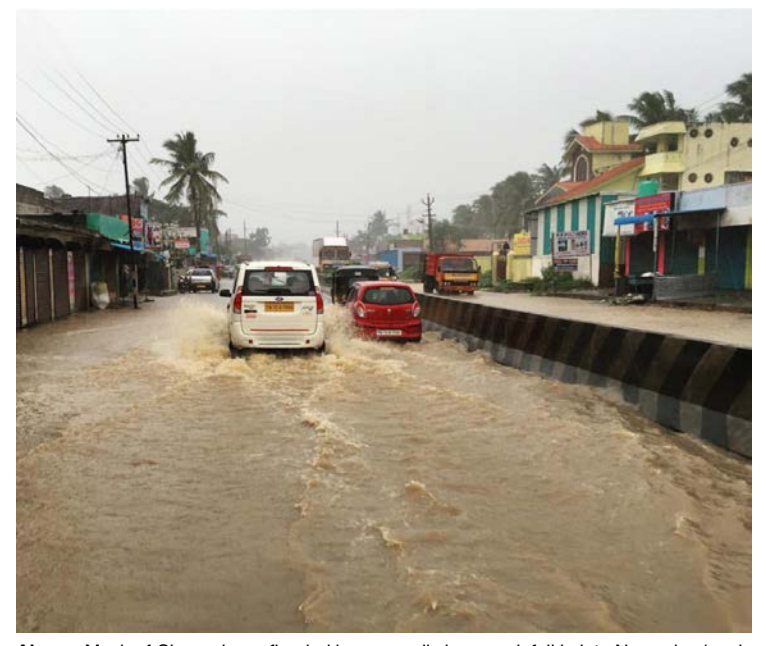
Above: Much of Chennai was flooded by unusually heavy rainfall in late November/ early December 2015.

As mentioned in the previous section, relatively high temperatures in the waters of the Indian Ocean may prevent El Niño from producing a serious drought affecting eastern Australia. But those high water temperatures, combined with the strength of the current El Niño have brought unusually high rainfall to the Tamil Nadu region of southern India and have caused dramatic flooding in Chennai, India's fourth largest city. In just 72 hours, starting on 29 November 2015, Chennai received 436mm of rain, having already had 623mm of rain from 8 to 22 November. Many parts of Chennai and its suburbs were submerged.