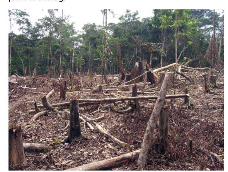
Above: Slash and burn in the Amazon rainforest leaves the land badly damaged. It can take years for the forest to recover.

Many of the fires are caused by farmers, who deliberately set fire to the forest to clear the land ready for planting with crops or for grazing cattle. This land clearance technique is known as 'slash and burn'. Fires made by humans kill up to half of the large trees and most of the small ones. Where big trees die, they open up gaps in the canopy, making the forest floor hotter, drier and more prone to burning.