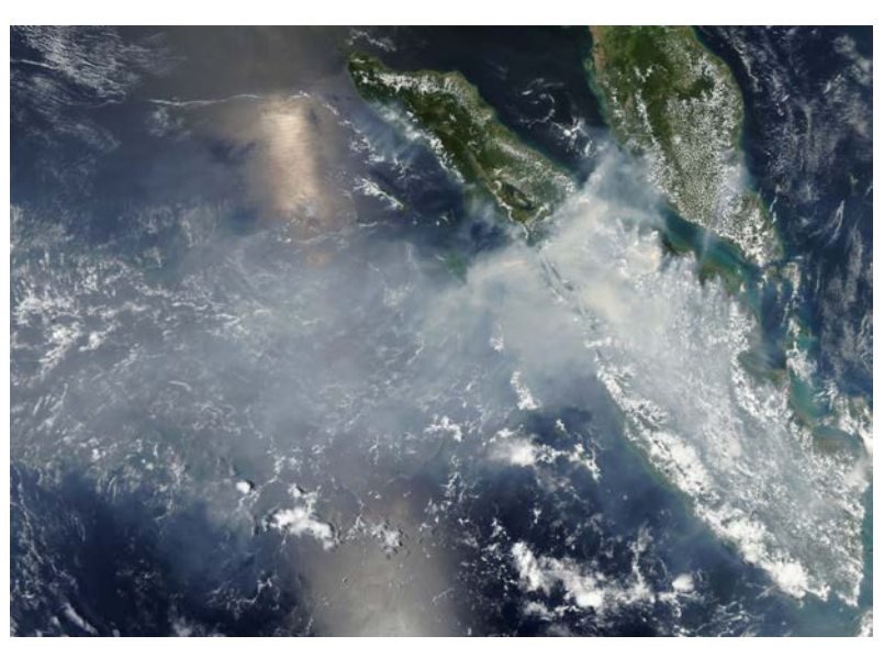
Above: Smoke from the fires in Sumatra is visbile from space.

The World Resources Institute has said "Taken together, the impact of peat fires on global warming may be more than 200 times greater than fires on other lands.