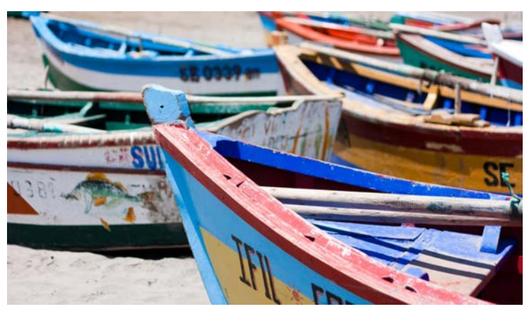
Above: Peru's anchovy fishermen have had poor catches in 2015 and they expect worse to come in 2016.

Peru has the world's largest stock of anchovy. But in 2015, the anchovy catch has halved to 2.5 million tonnes and fishermen are expecting it to get worse still in 2016. The anchovy fishery runs into difficulty because the warmer waters in the Pacific cause the anchovies to swim further south and dive deeper in search of colder water.