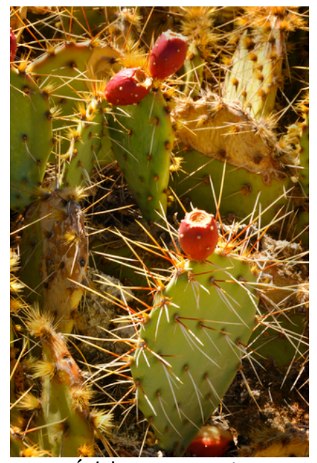
Prickly Pear Cactus

Did you know...? there are even kinds of cacti growing in rainforests! (They're just less prickly!)